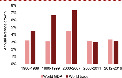
Chart of the month: World trade is expected to continue growing slower than global output

Cyclical factors have contributed, but structural factors are also at play. China's transition away from an export-led economy, increasing automation and difficulties in achieving new global trade deals are key factors which explain this pattern.